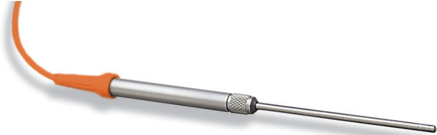
Fig. 1—ISO-COP-2 sensor

NOTES and TIPS contain helpful information.