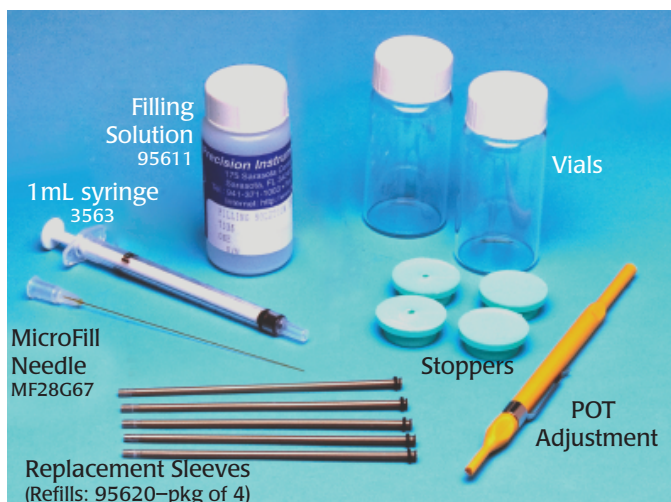
Fig. 4—ISO-COP-2 Startup kit